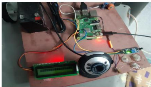
Fig 3 Initialization Of War Field Robot