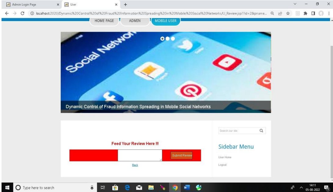
Feed user reviews here