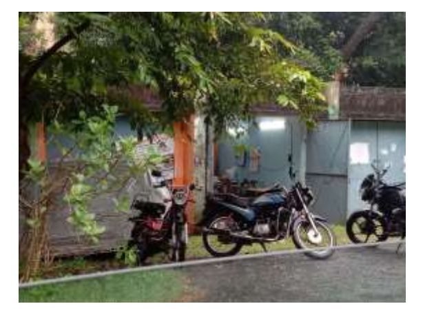
Parking being used as a studio at Vizag Steel plant Township

One of the important findings from a live case study that supports my hypothesis is of "Visakhapatnam Steel Plant Township, Ukkunagaram". The following observation has been recorded as on the day of site visit.