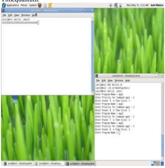
(2) Simulation for RRAlgorithm

In this above results "Experimental Result1" represents the role of a Mini-Processor along with the modified RR is shown. It shows how the Mini-Processor calculates the CPU burst for each application along with its Time slice or Timequantum.