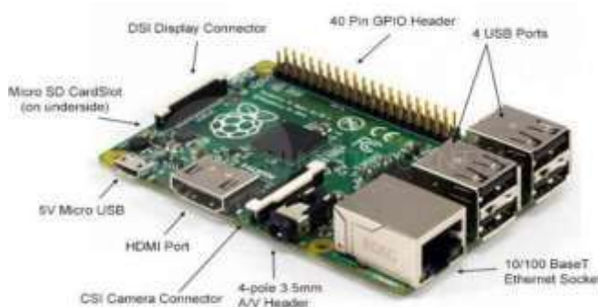
Figure 2: Raspberry PI model 2 board.

Raspberry PI is a card-sized ARM powered Linux computer development board. There are in total of 5 types of various board with different specification, for the proposed Weather forecasting system Raspberry PI 2 model B is used as the main development board which is shown in Figure-2.